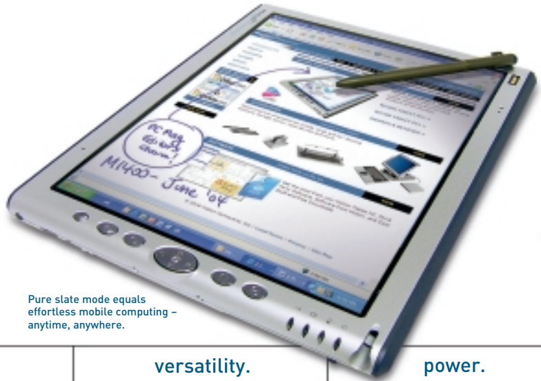
Pure slate mode equals effortless mobile computing - anytime, anywhere.

Motion Computing's award-winning M1400 Tablet PC product family offers unique, innovative technologies that advance Tablet PC computing to a new level. With Intel® Centrino™ Mobile Technology or Intel Celeron® M technology, high-speed wireless connectivity and outstanding battery performance, Motion M1400 Tablet PCs bring mobility, versatility and power to everywhere you work today.