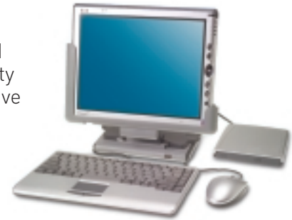
Grab-and-go docking: switch between work environments without interruption.

Enhanced Security: Motion M1400s feature an integrated fingerprint reader and security software that protects sensitive data, prevents unauthorized access to network resources and provides convenient, single-step, global password management.